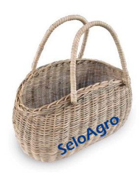
W16004 Material: rattan slimit