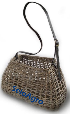
W16003 Material: rattan slimit