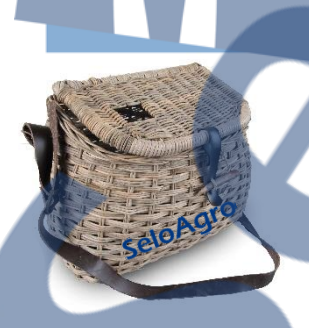
W16005 Material: rattan slimit