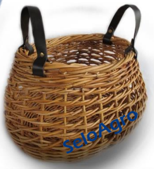
W16006 Material: rattan lacak