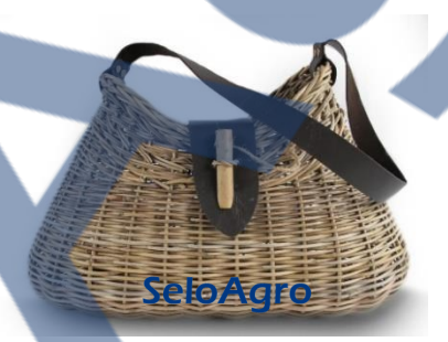
W16001 Material: rattan slimit

Also available in artificial leather. For this collection, you can choose two kinds of rattan material like rattan slimit or lacak