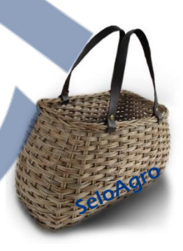
W16002 Material: rattan slimit